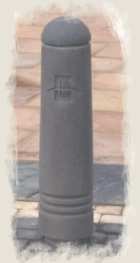
GATEWAY MINOR BOLLARD MOUNTED WITH NIB INSTALLATION SYSTEM