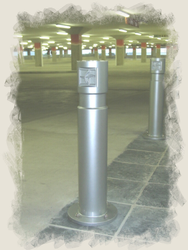
PINNACLE BOLLARD MOUNTED WITH BOLT PLATE