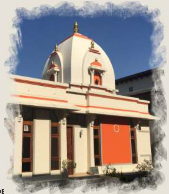
ASHRAM IN CHATSWORTH