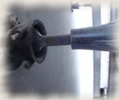
FAS CUP™ SYSTEM BY FAS TEGNIK (PTY) LTD

With the design flexibility that modubond offers, we have a large variety of mounting systems to offer, from the revolutionary new FAS CUP™ system by FAS TEGNIK (PTY) LTD using a hidden anchor mounting, to 3M's VHB tape onto stainless steel top-hat brackets, and for the more elaborate designs, custom manufactured resocrete top-hat brackets.