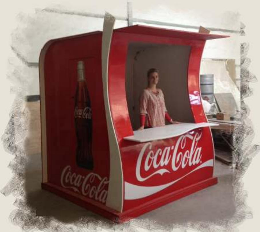
MODULAR COKE KIOSK