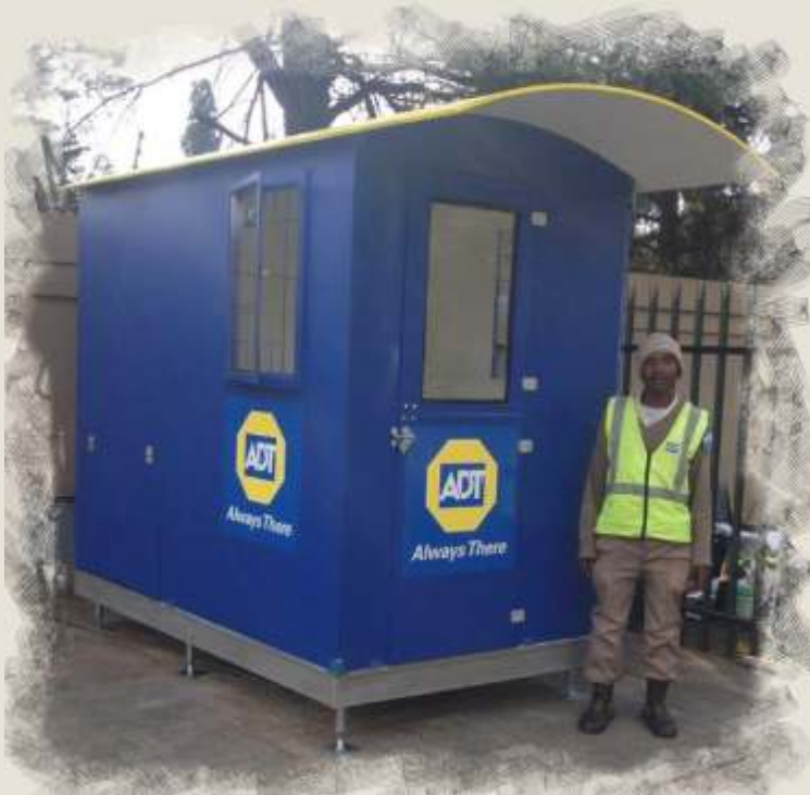
MODULAR SENTRY 1500 X 2500 GUARD-HUT

As shown by the tests below, the moducrete LamPlas Polymer Composite Panel attains high strength and flexibility, and is UV stable