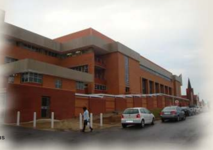
MODUBOND OYSTER SILICA SATIN FINISH PORT SHEPSTONE HOSPITAL

Visit our web-site at www.resocrete.co.za