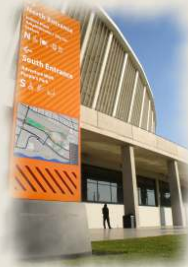
ZIM BLACK MODUBOND MOSES MABHIDA SOCCER STADIUM DURBAN