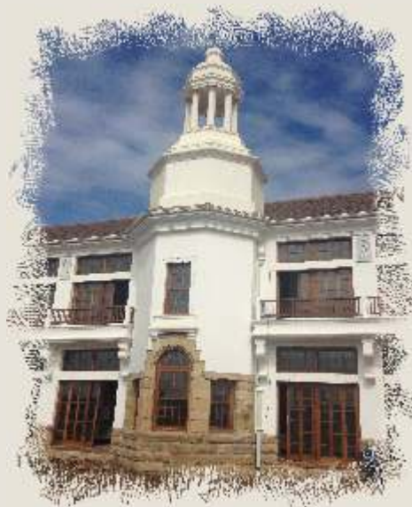
PAVILLION, MOULDINGS & BALUSTRADE ADDINGTON CHILDRENS HOSPITAL