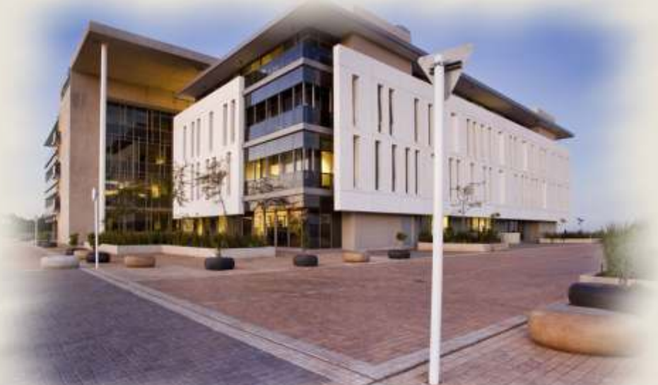
MODUBOND CRYSTAL WHITE PANEL RIDGESIDE, UMHLANGA