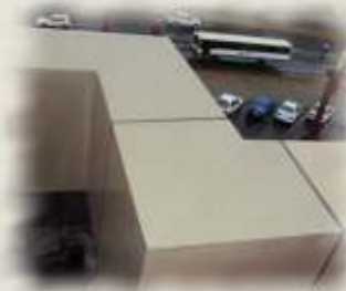
MODUBOND ON STAINLESS STEEL TOP-HAT BRACKETRY SYSTEM INCORPORATING 3M VHB ADHESIVE TAPE