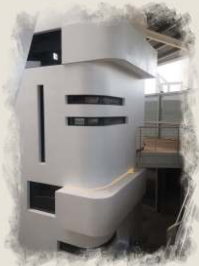
COMPLEX MOULDINGS BALLITO LIFESTYLE CNTR