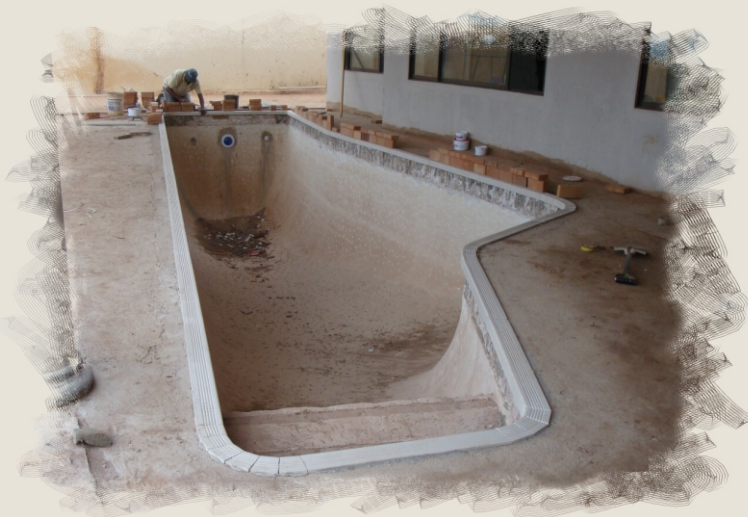
MODUMOULD COVINGS BEING FITTED TO SWIMMING POOL - LA LUCIA

As the Covings are manufactured out of the Mod 38 compound which is a very hard wearing substrate, we advise that all cutting be carried out with either a diamond blade or a masonry blade fitted to the cutting machine.