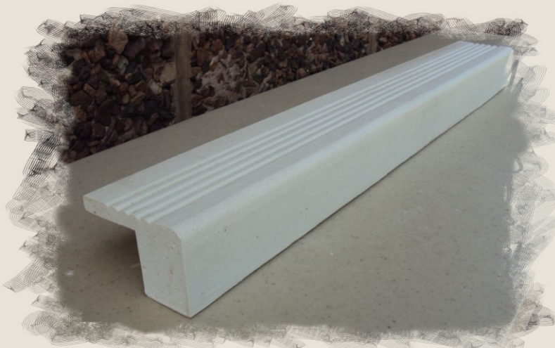
MODUMOULD POOL COVING SHOWING REEDED SURFACE FOR WATER DRAINAGE