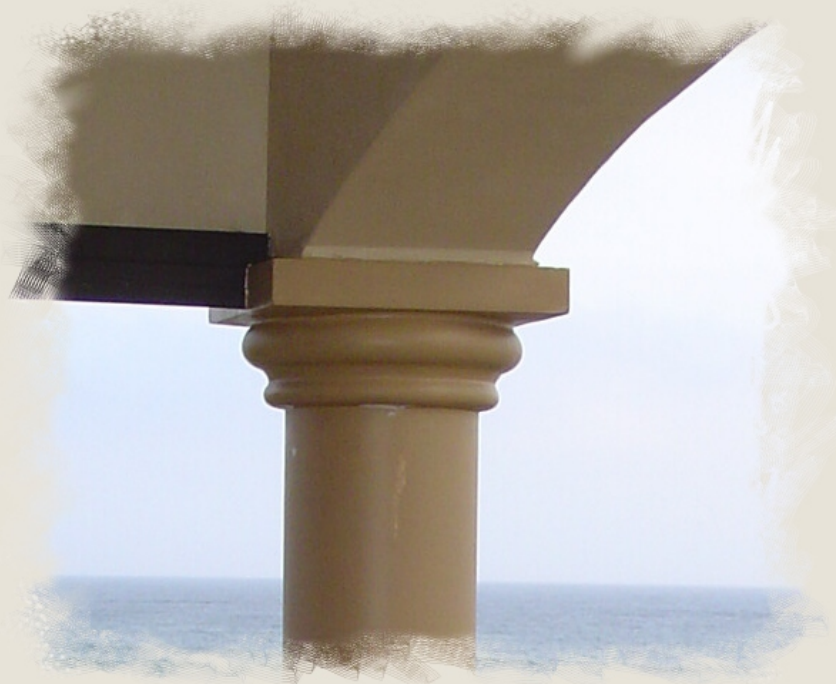
PERMACAP ON 350mm DIAMETER PERMASTRUCT COLUMN