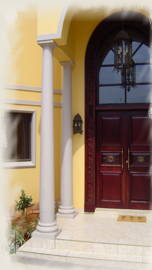
TAPERSTRUCT COLUMN WITH CAPITAL & BASE